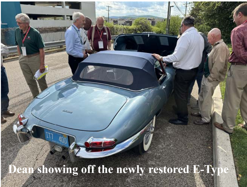
Dean showing off the newly restored E-Type