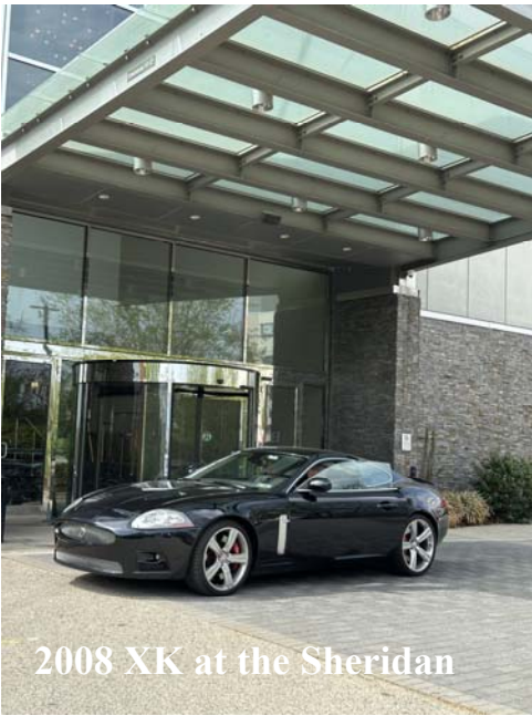
2008 XK at the Sheridan