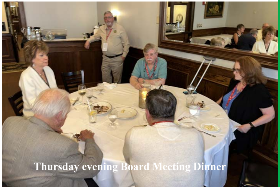
Thursday evening Board Meeting Dinner