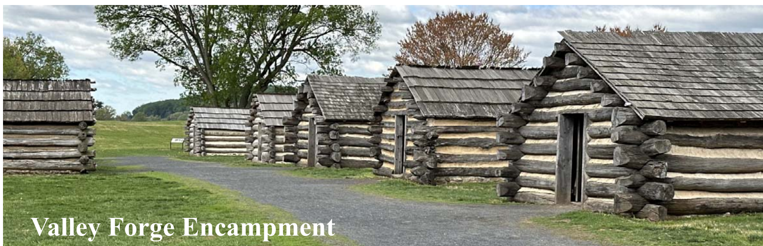
Valley Forge Encampment