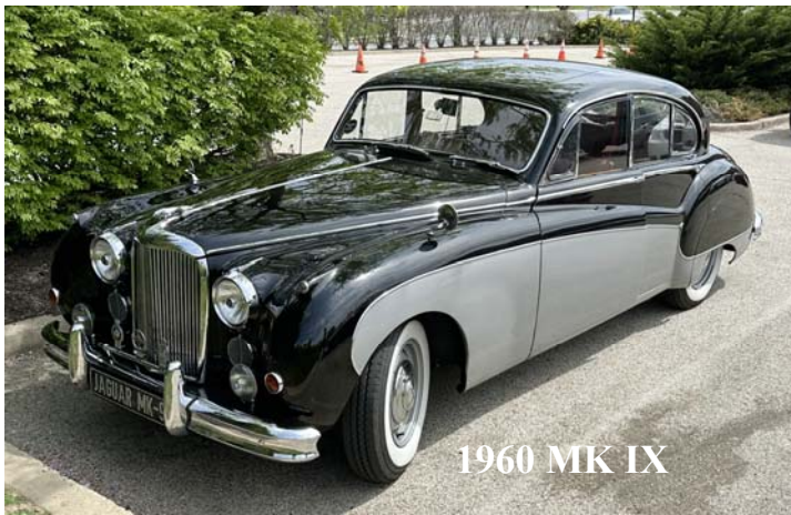
1960 MK IX