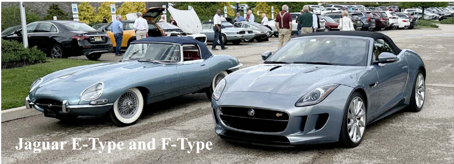
Jaguar E-Type and F-Type