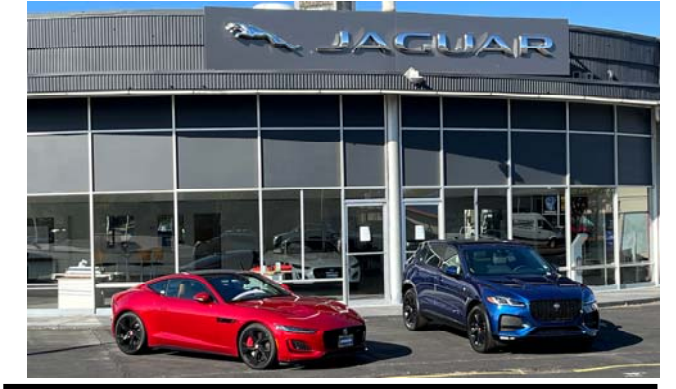
Be sure to come in and see the new Lakewood Jaguar Dealership at Colfax and Allison, just a few blocks west of Wadsworth

Thank you to Lakewood Jaguar for your continuing RMJC support and your Raffle Donations. Please support Lakewood Jaguar