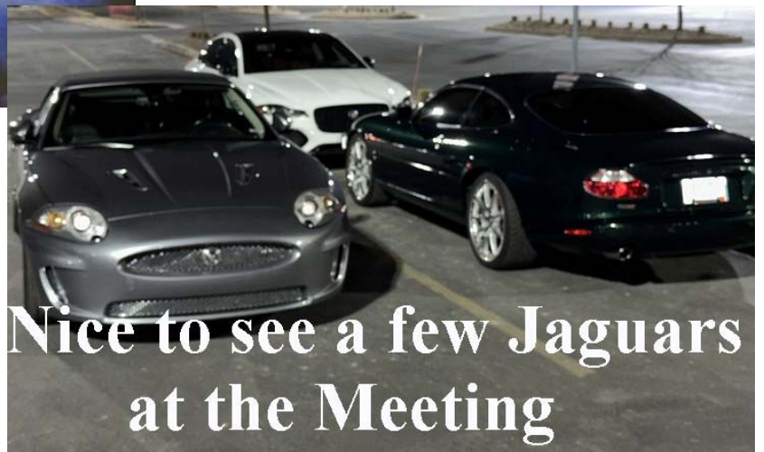
Nice to see a few Jaguars at the Meeting