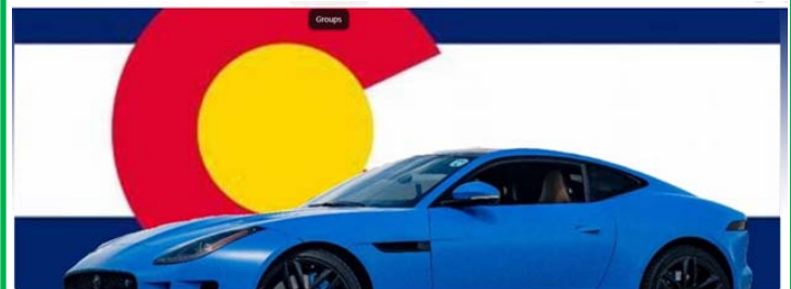
Colorado F-type Owner's Club

Please reach out to him on Facebook under Colorado F-Type Owner's Club (group) or cecil.raasch@yahoo.com