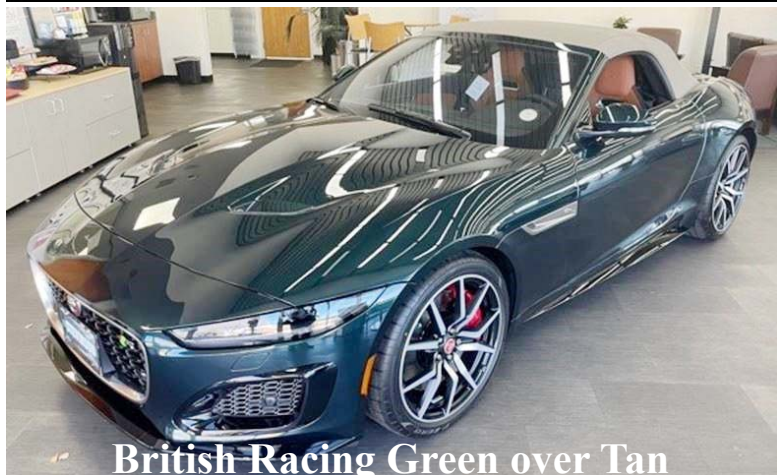
British Racing Green over Tan or Indus Silver over Red

Contact Mark for details at 303-794-5560 or mbarnett@stevinsonauto.com