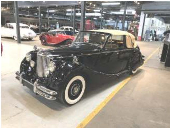
The Mark V that is the object of our restoration effort