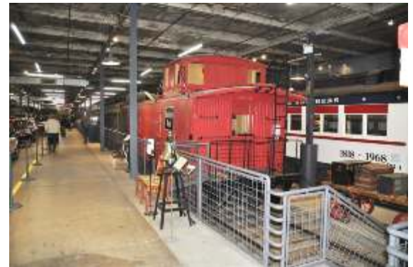
The trains were a bit neglected tonight.