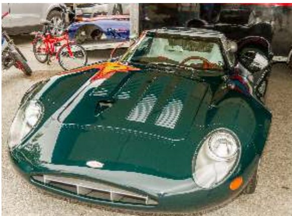
where did this come from?