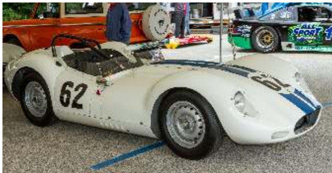
a Lister Jaguar and a mysterious XJ13

They race all four days, Thursday through Sunday, and there are cars on the track all of the time. There are many, many classes to choose from for our watching enjoyment. But watching the cars run isn't the only reason to be there. We also walked many miles up and down the hills to look in the garages to see what the entrants were hiding.