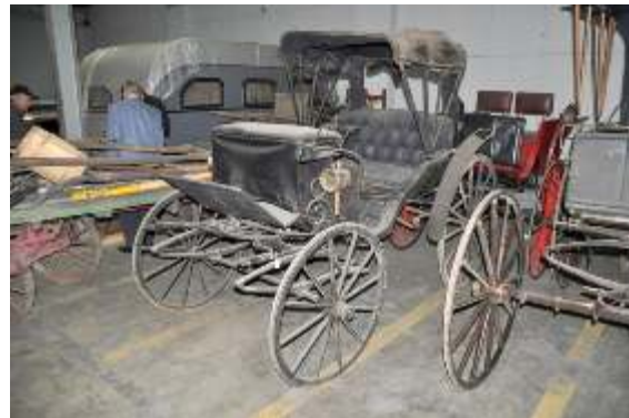
The back rooms held some really old carriages