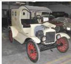
This one is FOR SALE