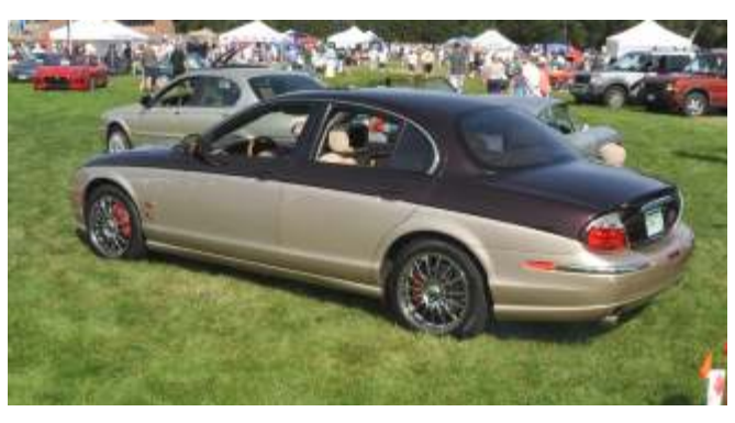
This two-tone Jaguar S belongs to Ian Patrick and is actually wrapped with two colors of film.