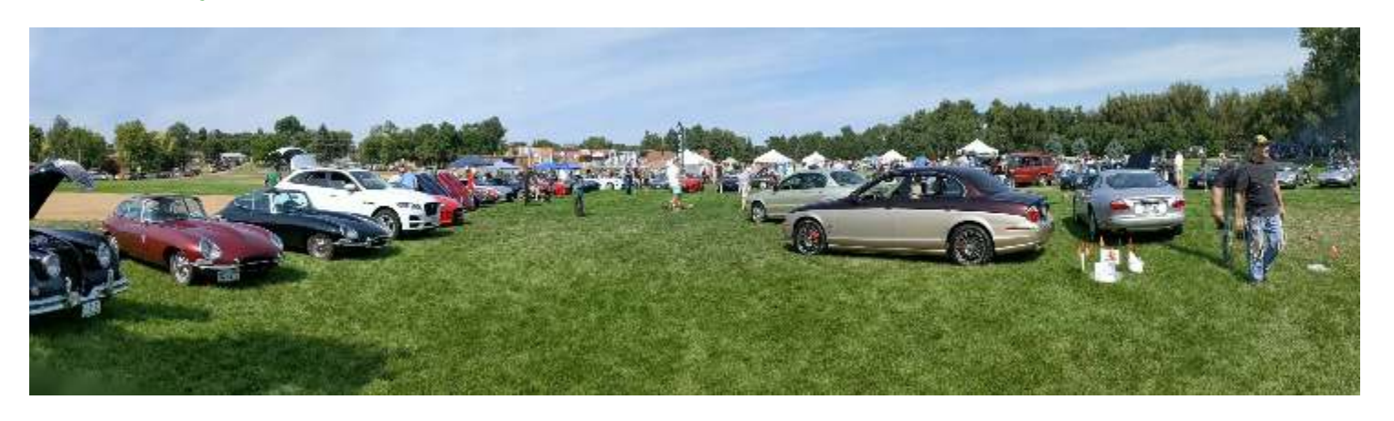
Jaguars Everywhere at the British Car Conclave More than 40 of them on the grass at one time! The Story and Photos in this Newsletter