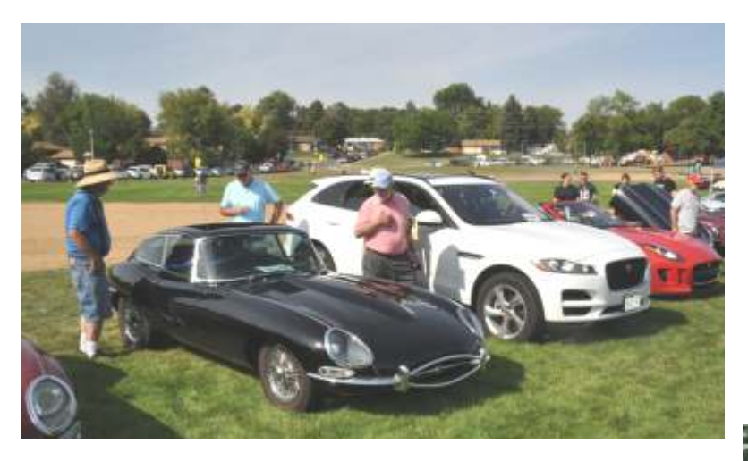
Old and New - Jaguar make attractive cars