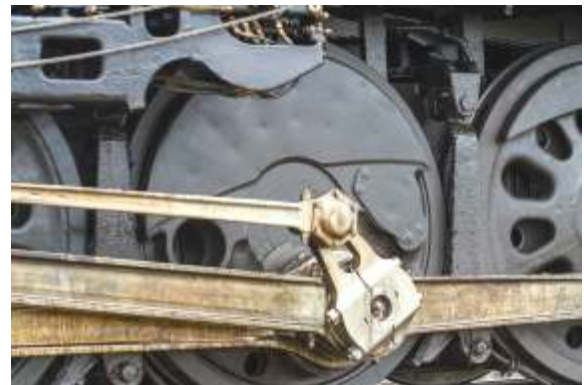
Big Animals and Big Machinery at the Big Boy Train and Bison Ranch Excursion, page 14