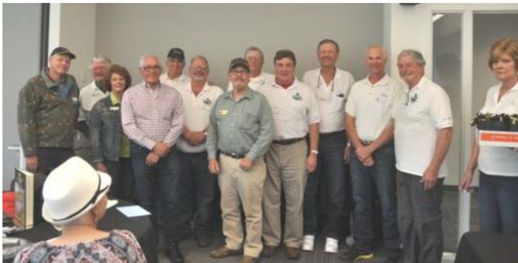
Judges and Scoring for the 2019 Concours