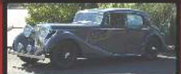
1948 Mark IV 3.5 Saloon • Stock #: J48-175