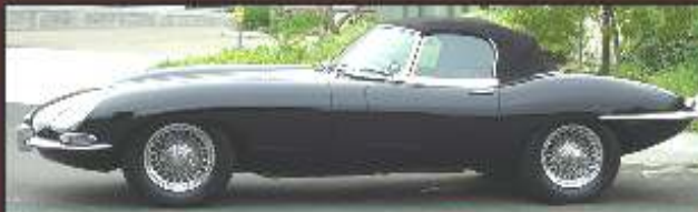
1966 XKE Series 1 4.2 OTS • Stock #: J66-911 • Triple Black, Concours-Ready!