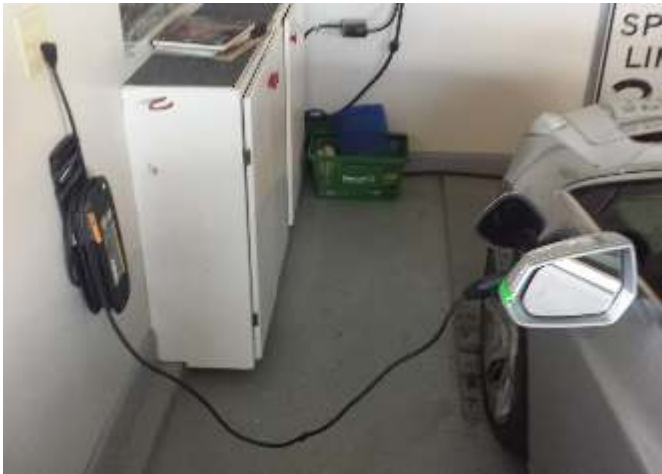
The photo above shows a Level 1 charger plugged into a 120 volt socket and charging a Cadillac ELR at a 5 mph rate

These photos below show a Level 2 charger by Cripple Creek charging a VOLT at 240 volts producing a 15 mph charge rate