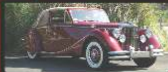
1951 Mark V 3.5 DHC • Stock #: J51-465