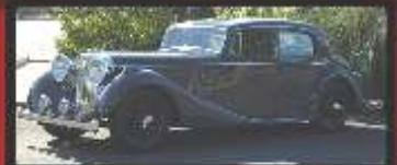
1948 Mark IV 3.5 Saloon • Stock #: J48-175