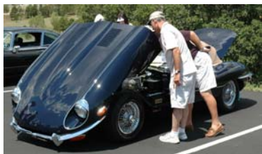
Judging at 10:30