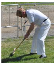
Croquet at 2