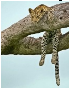
Distant relative hanging out

2012 Jaguar XJ. A modern flagship for a classic auto maker.