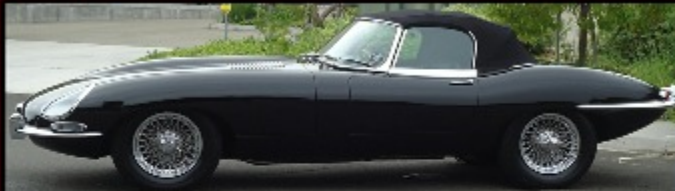
1966 Jaguar XK Series 1 4.2 OTS

Classic Showcase is restoring history and making Champions