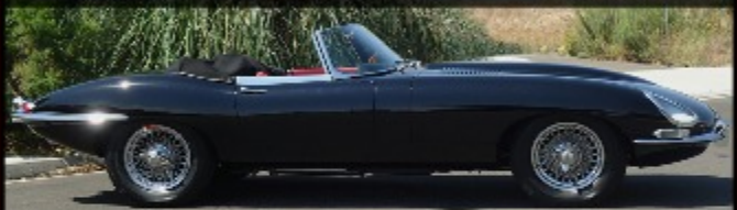
1963 Jaguar XK Series 1 3.8 OTS