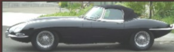
1966 XKE Series 1 4.2 OTS • Stock #: J66-911 • Triple Black, Concours-Ready!