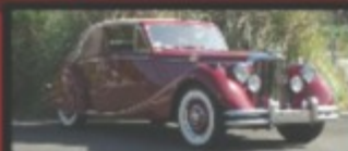
1951 Mark V 3.5 DHC • Stock #: J51-465

Classic Showcase offers these examples of historical perfection