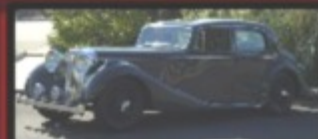
1948 Mark IV 3.5 Saloon • Stock #: J48-175