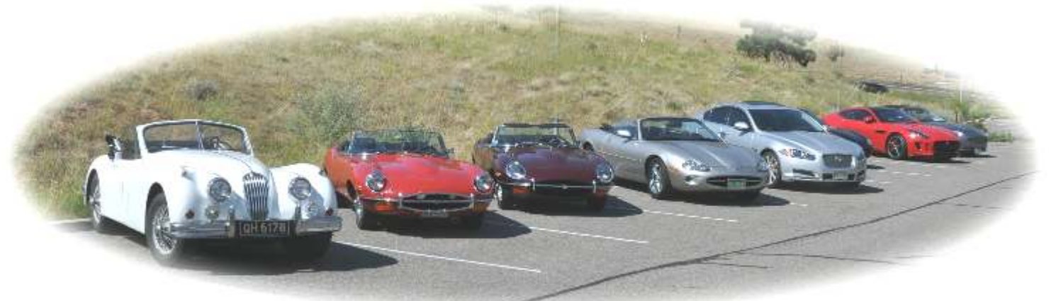
Eight of the Jaguars at the summer party made a spectacular line-up.