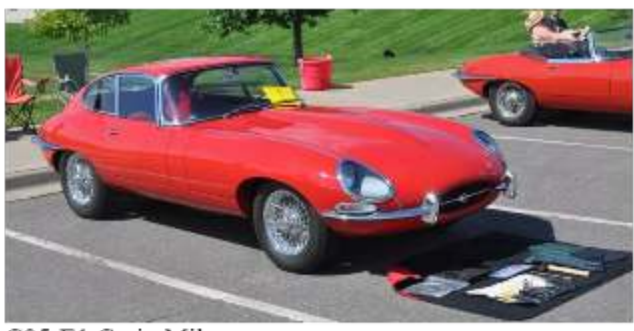
C05-E1 Craig Miles