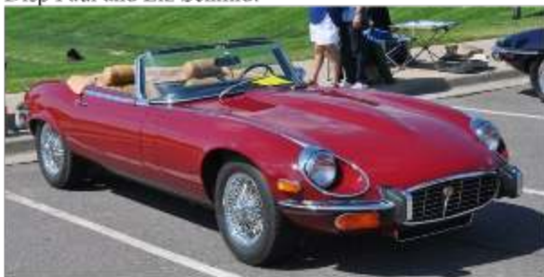
Disp Pete and Sue Day