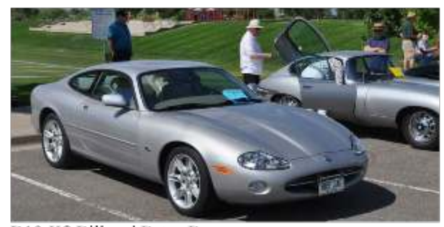
D10-K8 Bill and Betsy Beeson

"Disp" cars were on Display at the show but were not judged