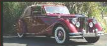
1951 Mark V 3.5 DIIC • Stock #: J51-465

Classic Showcase offers these examples of historical perfection