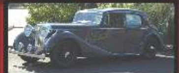
1948 Mark IV 3.5 Saloon • Stock #: J48-175