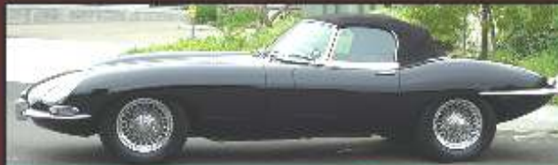
1966 XKE Series 1 4.2 OTS • Stock #: J66-911 • Triple Black, Concours-Ready!