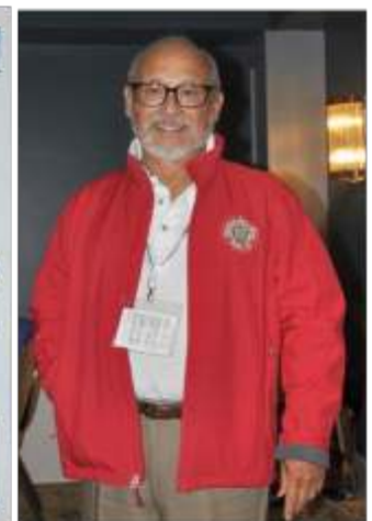
Santa Barbara IJF Jacket