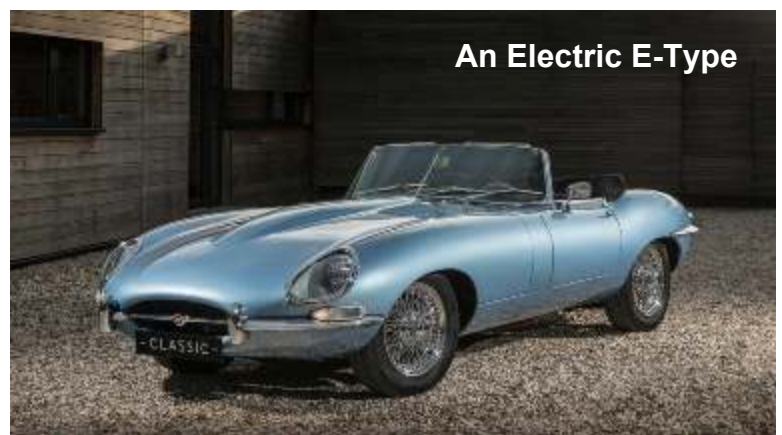
An Electric E-Type